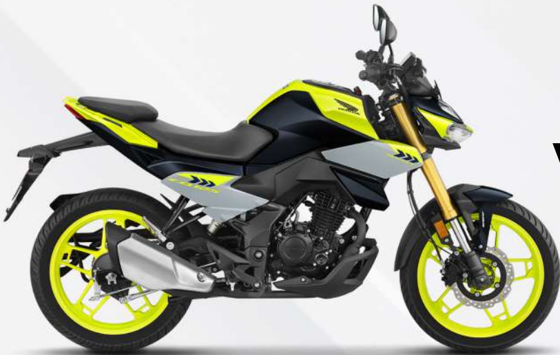
Pearl Siren Blue with Lemon Ice Yellow